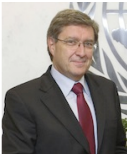
Enrico Giovannini , Professor at LUISS Guido Carli University and Former Minister of Labour and Social policies

Enrico Giovannini is an Italian economist and statistician, member of the Club of Rome. Since 2002 he is full professor at the Rome University "Tor Vergata". He was Minister of Labour and Social Policies in the Letta Government, President of the Italian Statistical Institute, Director of Statistics and Chief Statistician of the OECD.